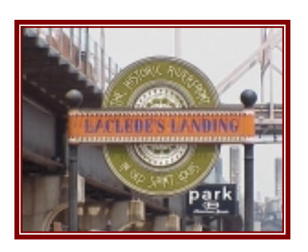
There'll be plenty to do at this year's conference!