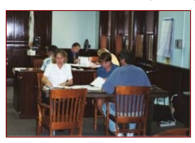
NCP's review their files at Knox County settlement sessions

These initiatives ensure that the Illinois Child Support Program focuses the most time and energy on cases where both the custodial and non-