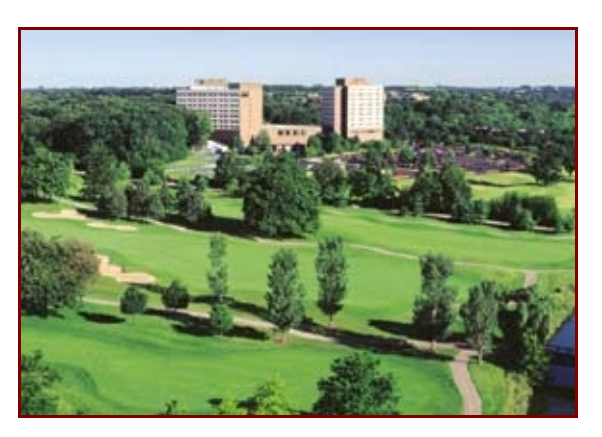
Hickory Ridge Marriott Conference Center, Lisle

IFSEA's 14th Annual Conference on Support Enforcement and Members' Meeting will be held October 20-22, 2002, at the Hickory Ridge Marriott Conference Center at 1195 Summerhill Drive, in Lisle, Illinois. The conference center is located 40 minutes west of Chicago, just off I-355, south of I-88, so it is easily accessible by car. (See the inset on page 4 for map and directions.) The hotel uses My Chauffeur and American Limousine service for transportation to and from Chicago airports. The rates are $18.00 per person to and from O'Hare and $23.00 per person to and from Midway. For reservations and information call 630-920-8888 or 1-800-762-6888.